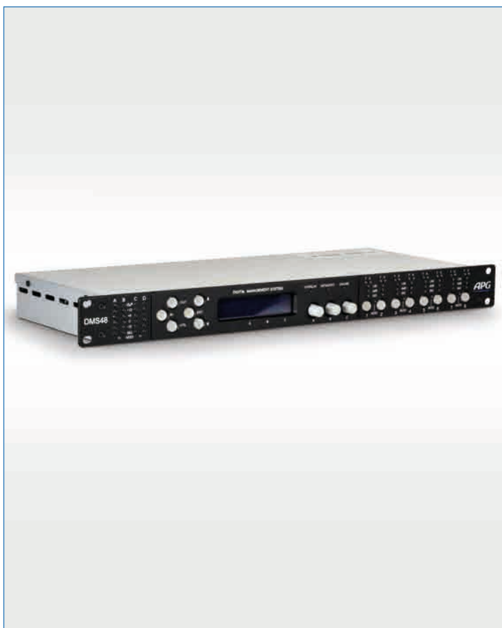
Digital System Processor DMS48

The APG DMS48 digital processor is primarily intended for the management and processing of large, complex systems, but also for loudspeaker processing in cases where systems are operated at their maximum power. The large number of filtering, equalization and time alignment functions makes the product ideal for the configuration and processing of FOH systems.